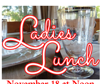
November 18 at Noon Olive Garden